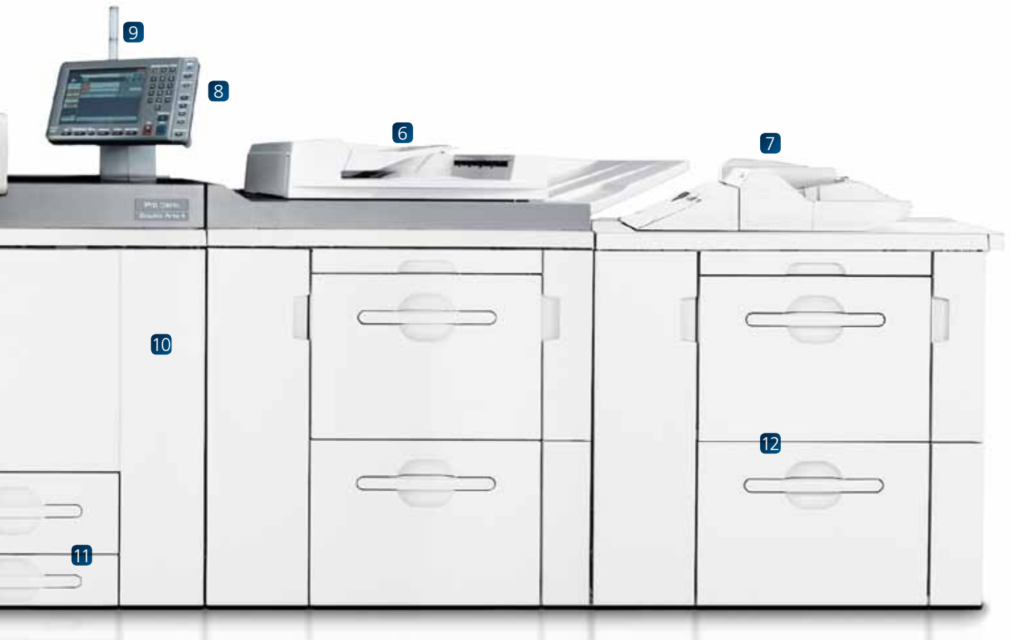
Ricoh Pro C901 GA+ series

Enjoy end-to-end automated workflows for advanced print management with a new fiery EB 42 Controller. Based on EFI's popular fiery server technology, it supports a wide range of capabilities including Advanced Job Re-order, Tab Inserts and more.